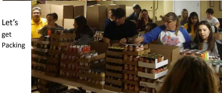
Let's get Packing