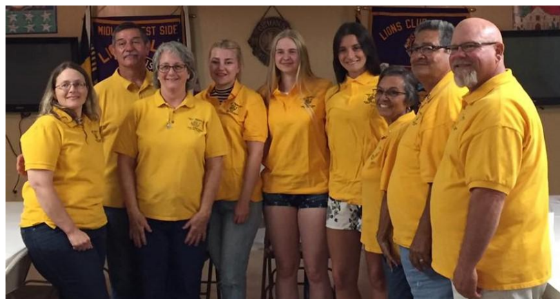
Midland West Side Host Ice cream Social for exchange students