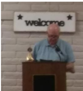
Colorado City Mayor reading proclamation