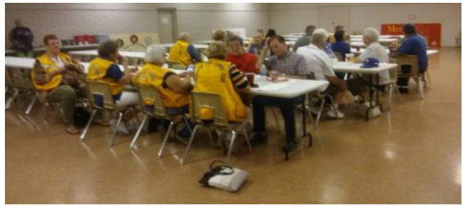
Friday Night Social