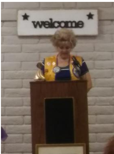
The charismatic Colorado City Lions Club President