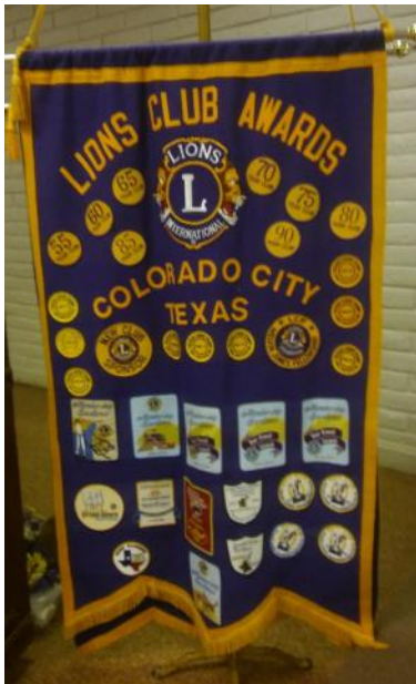
Colorado City Lions Club Banner 95 years young