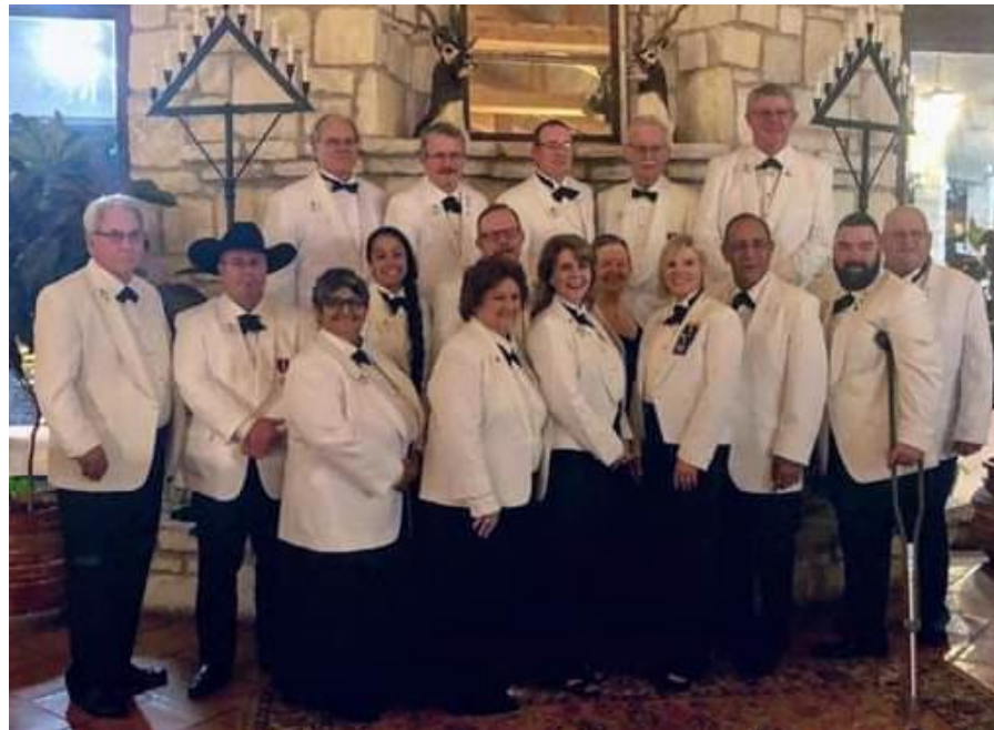
The 2nd VDG for 2019-2020, They will be our 2023-2024 Governors