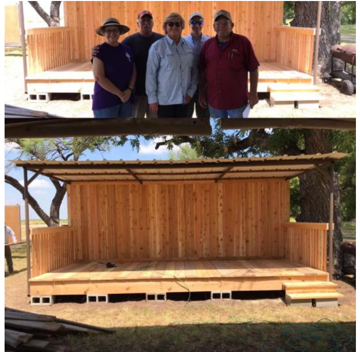
Before and after . Ta-Da!!!!!! San Angelo Dynamic Downtown Lions Club doing what we do best

Texas Lions Camp Picnic Lottery Registration opens up on October 1 and closes on October 15. Picnics are awarded on October 15.