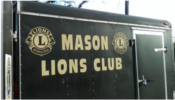
Mason Lions Club ran the concession stand at the Mason Roundup Rodeo. 7-13-19