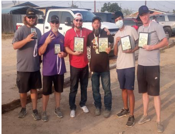
1st place winners centered, 3rd place on left and 2nd place on right

Midland West Side Lions Club 1st Annual Toss for a Cure Washer Pitching Tournament benefiting Childhood Cancer assistance in the Permian Basin