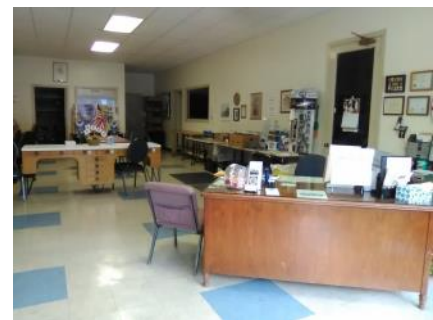
View from reception to work area...folks enjoy seeing what we do