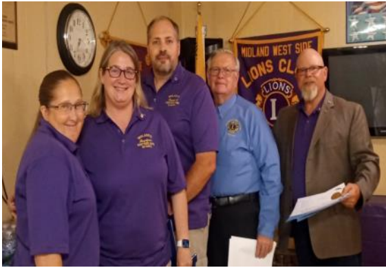
DG Glen inducting Midland West Side New Members