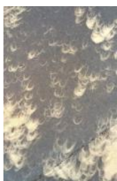
Bingo, Sharing of Great Ideas, Good Food and the Eclipse