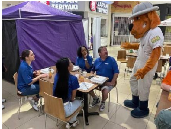
Having fun at the We Serve Breakfast!