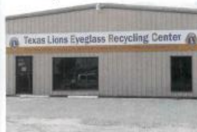
Eye Give Program

Recycling Center (TLERC) is a nonprofit 501(c)(3) foundation that provides eyeglasses and eye care programs to those in need throughout Texas, the United States and worldwide. We collect used and new eyeglasses, clean, refurbish and distribute them through mission trips worldwide and in Texas through Local Lions Clubs in your community.