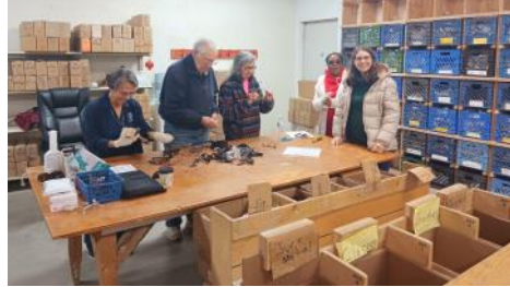
Sorting at TLERC