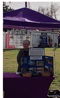
Vision Screening at 1st Christian Church Eggstravaganza Event