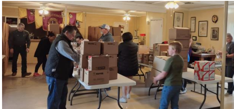
Packing Easter Food Boxes