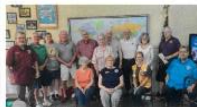
Eye Give Program

TLERC provides used eyeglasses to Lions and other group missions providing vision screening and assistance in developing countries. Recycled glasses are supplied only under the guidelines of Lions International Eyeglass Recycling Center.