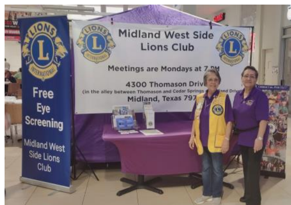
Midland West Side Conducts vision at the Midland Northside We Serve Breakfast.